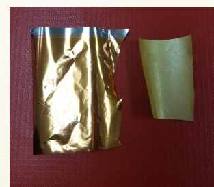
Get transfer foil pieces. Shiny side up. Dull-side down on stickies.