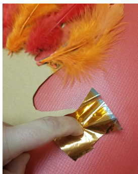
Get transfer foil pieces. Shiny side up. Dull-side down. Add shine to your beak. Cut into strips and make patterns.