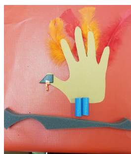
Flip your turkey over and place tubes along bottom where fingers belong.