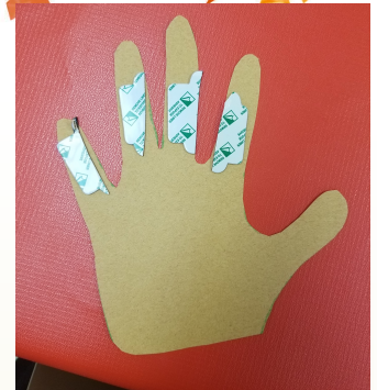
Attach to hand