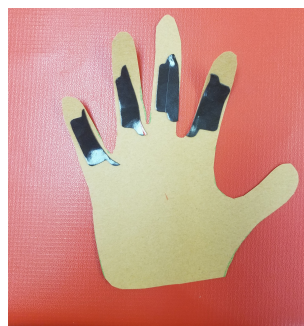
Peel off the other side