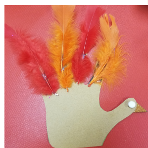
Put feathers on top of stickies. Add eyes,