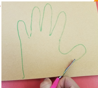
Trace & cut out hand