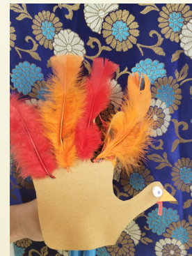
Pop your fingers in to the tubes and walk your turkey around!